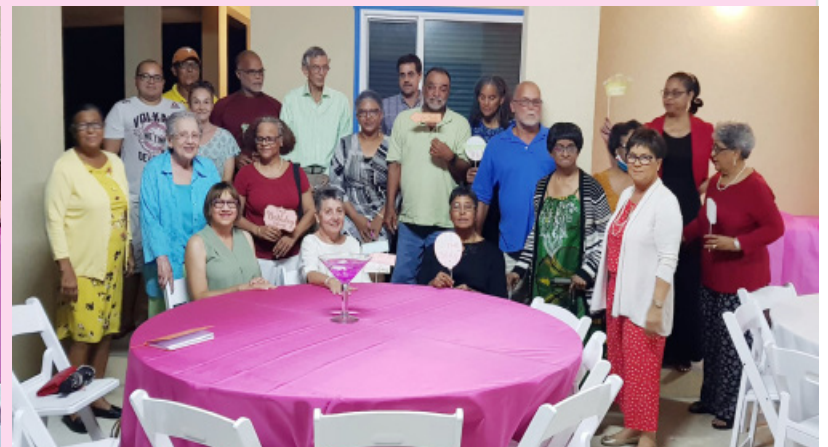
80th Birthday Celebration