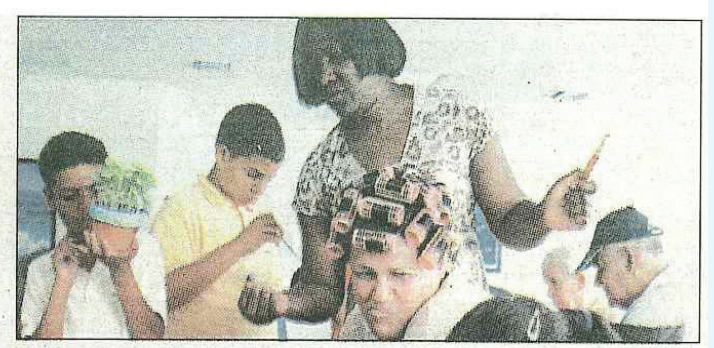
Kids with Hearts and volunteers work with seniors.